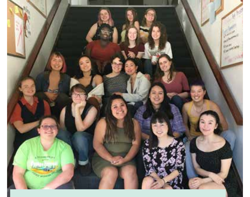
∧ HOYT HALL BRUNCH FOR RECENT GRADS DARCom has been encouraging and supporting our members when they want to organize alumni events.

DARCom has been working on creating more volunteer opportunities and events for alumni-student engagement. You can see some of the fruits of their labor in this issue, including an upcoming Alumni Work Day in April. I thank all alumni who have offered us encouragement and support as we continue to evolve our alumni relations, with the ultimate goal that our alumni have a stronger affinity to our mission and our students.